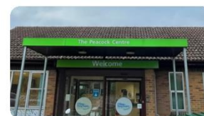
The Peacock Centre Cambridge

The South Team are based at The Peacock Centre in Cambridge and Princess of Wales Hospital in Ely.