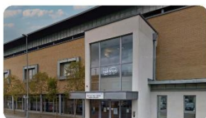
Oak Tree Centre Huntingdon

The Occupational Therapy Service has two core teams located in North and South Cambridgeshire and a housing team that works across both areas.